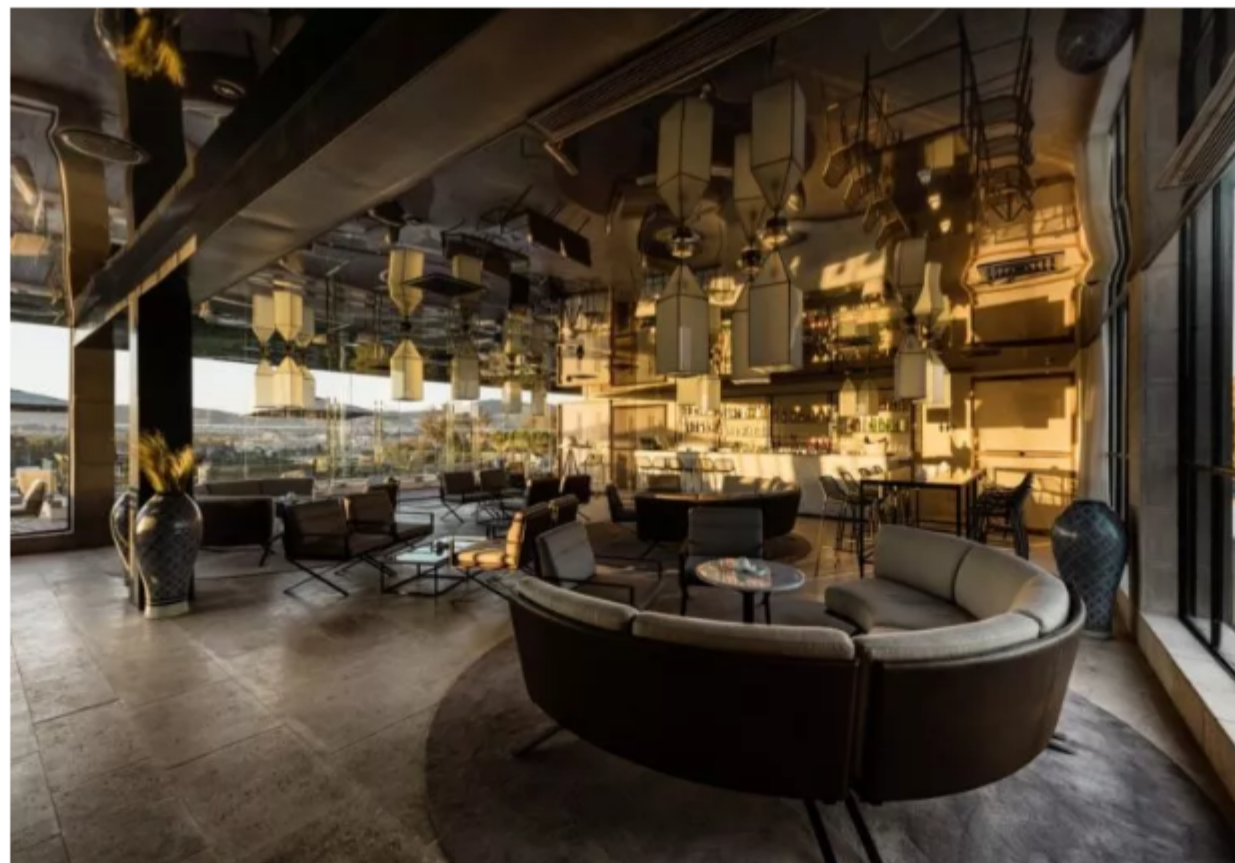
Hotel Sahrai, Fez

Hotel Sahrai (inset above) (3) on the edge of the Ville Nouvelle is a boldly designed boutique hotel. Contemporary rooms are decorated with local stone, metal and glass, there's a Givenchy spa, and the infinity pool and rooftop bar overlook the medina. Doubles from MAD1,600 (£128), B&B.