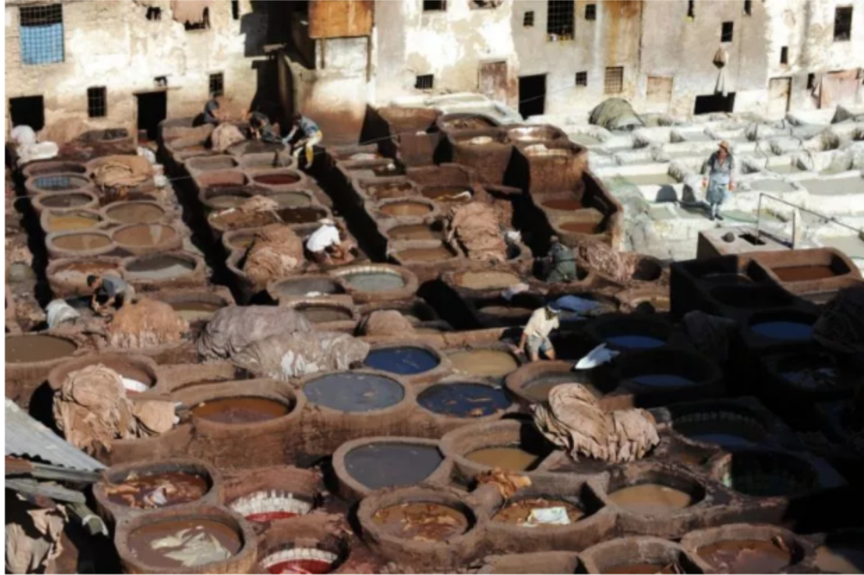
A general view shows workers working at the tanneries in Fes.

Go souk shopping for butter soft leather coats, babouche slippers, beaten metal lampshades, shaggy Berber rugs and more. Be sure to haggle – but only if you're serious about buying.