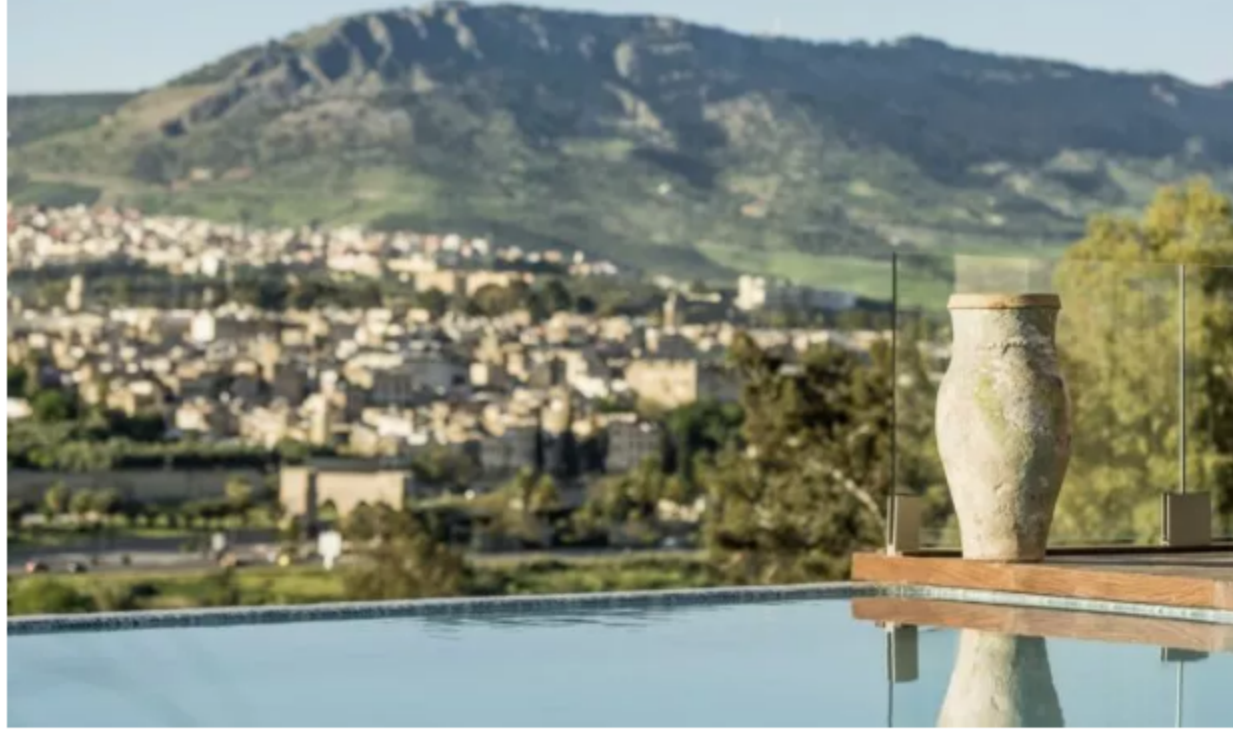
Hotel Sahrai, Fez