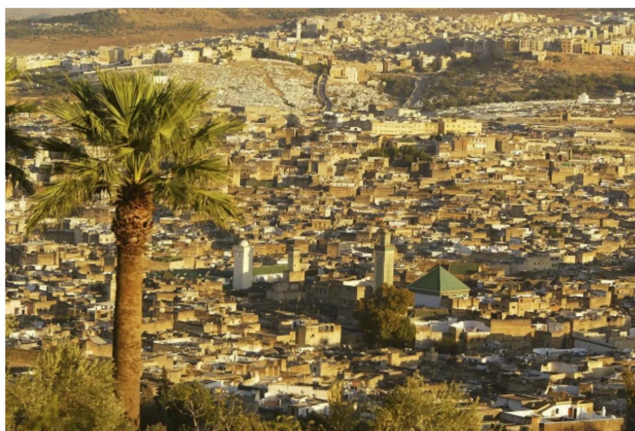
A general view of the Medina in Fez, Morocco.

Explore the souks, palaces, mosques and monuments of Fez el Bali – the world's largest living medieval medina